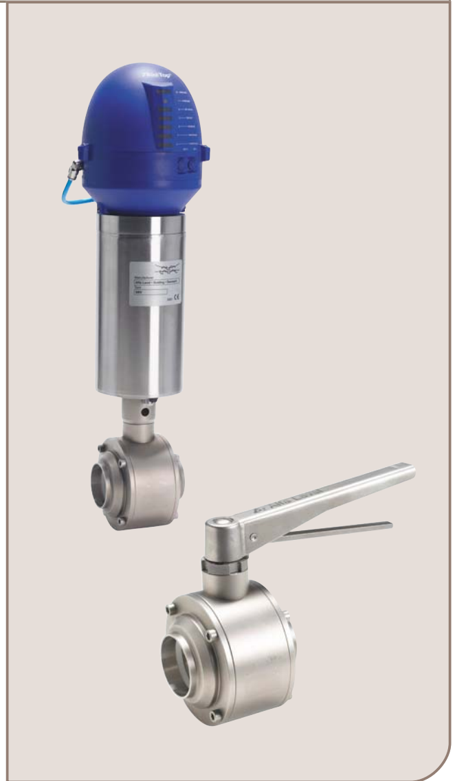
SBV with actuator and ThinkTop® (option)

The stainless steel handle for manual operation mechanically locks the valve in open or closed position. The valve is assembled with screws for easy inspection and maintenance.