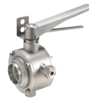
Handle and bracket for inductive proximity switches