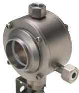
Cavity cleaning connections