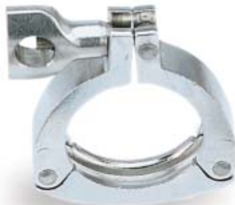
Tri-Clamp - The industry standard.

A connection is made up of a plain ferrules, a threaded ferrule, a nut and a gasket. The faces on Bevel Seat fittings are angled to create a metal to metal sealing surface. A John Perry fitting consists of a flat-faced threaded ferrule, a flat-faced plain ferrule and a profiled gasket. These joints are particularly useful with swing connections and flow diverter panels. A DC fitting utilizes the Bevel Seat plain ferrule and a threaded ferrule with a grooved face to retain a gasket. The three types of threaded fittings are designed for use in the food, dairy, and beverage processing industries. Bevel Seat Joints are in compliance with 3A standards for manual cleaning. Both John Perry and DC fittings are in compliance with 3A standards for CIP.